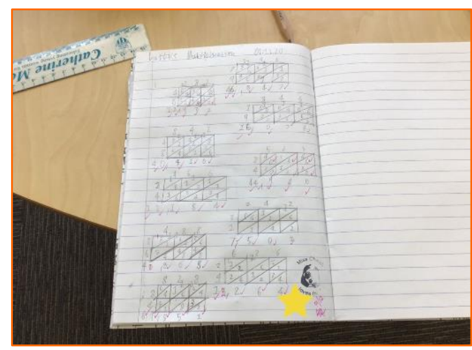
Stage 2 completed some very impressive Maths with some rather large numbers!